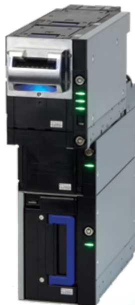
MRX-SNF 1 Recycling Module Cash Box