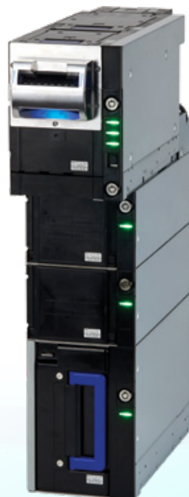
MRX-SNF 2 Recycling Modules Cash Box