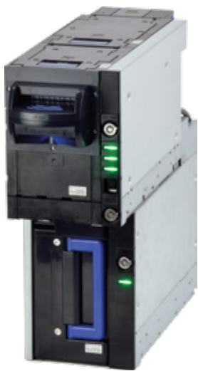
MRX-BNF Cash Box