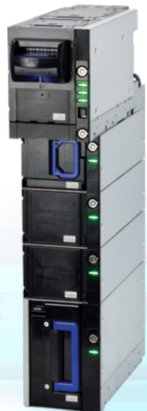
MRX-BNF 1 Loading/Dispensing Module 2 Recycling Modules Cash Box

Configurations above are only examples of what is available