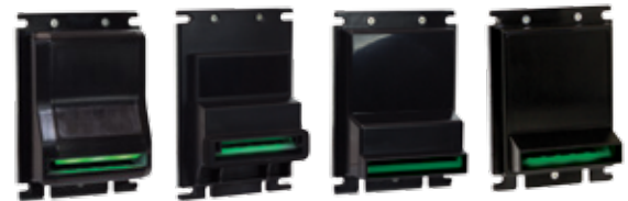
Left to Right: JCM Standard, TOB, Euro and Snack Mask