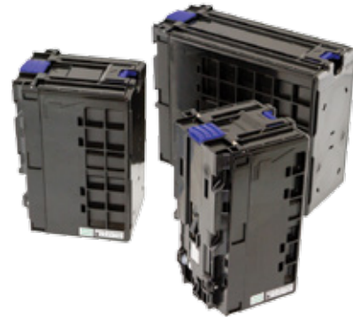
Note Capacities – 300, 500 and 1000