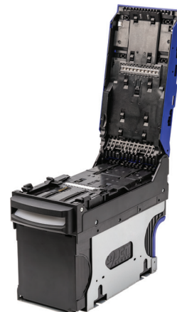
Thumb Lock or Coin Lock