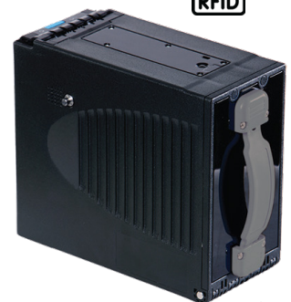
• 800 notes Cash Box