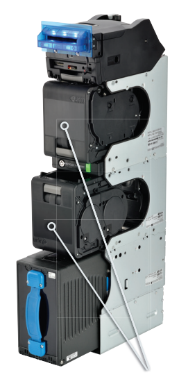
Removable Recycling Modules