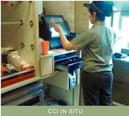
CCI IN SITU