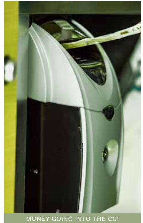
MONEY GOING INTO THE CCI

The lengthy development process of the CCI was rewarded in 2010 with the first major order for 3,500 units from retail chain Wilko. The following year, Volumatic was awarded the prestigious Queen’s Award for Innovation for CCI. Major orders for CCI followed from retailers, including the largest to date from supermarket chain Morrisons, which placed an order for 11,500 units in 2012.