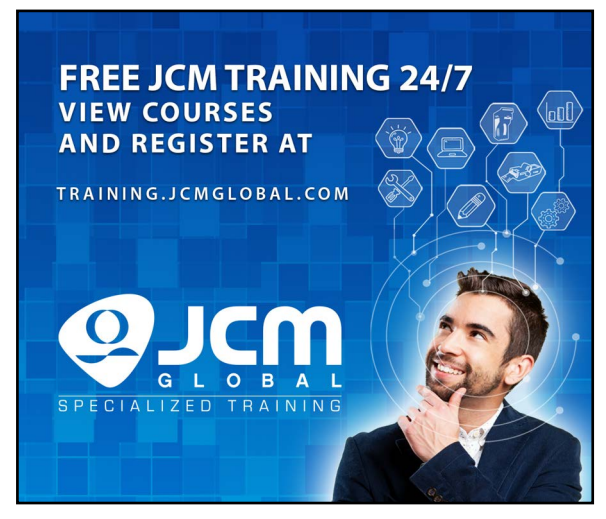
Figure 2 JCM Online Training

For information about other JCM Products, visit the JCM Global website at www.jcmglobal.com, or contact your local JCM Sales Representative at (800) 683-7248.