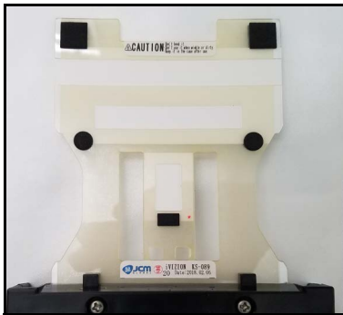
Figure 1 iVIZION® Calibration Reference Paper KS-089