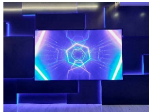
MotorCity Casino Hotel