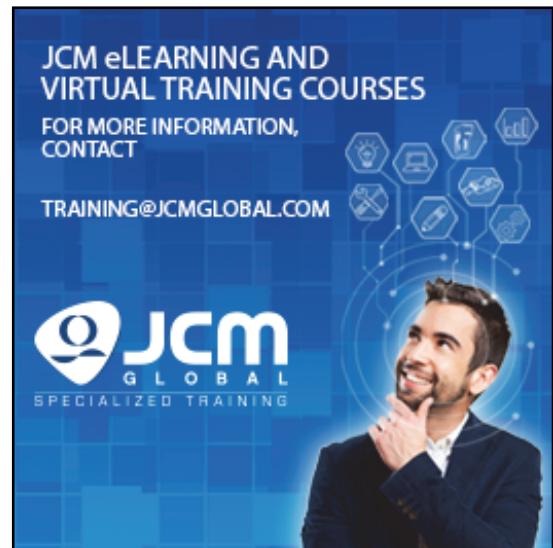
Figure 2 Click above to go to the JCM Global eLearning Site

For additional information on JCM Products, visit the JCM Global website at www.jcmglobal.com , or contact your local JCM Sales Representative at (800) 683-7248.