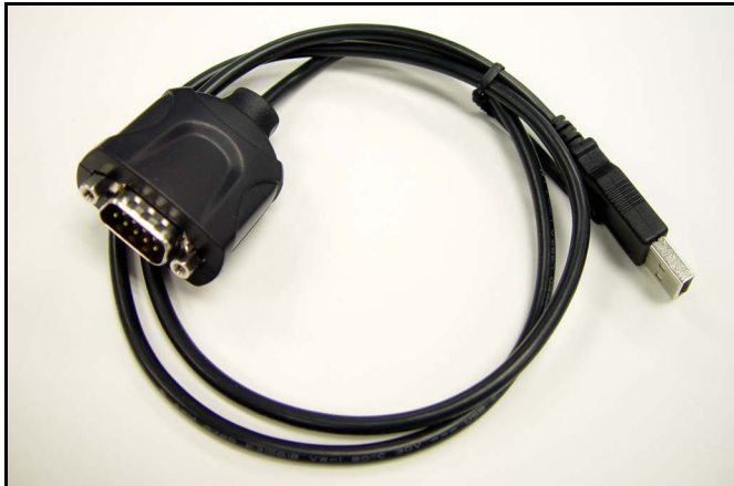
Figure 1 SIIG® USB to Serial Adapter