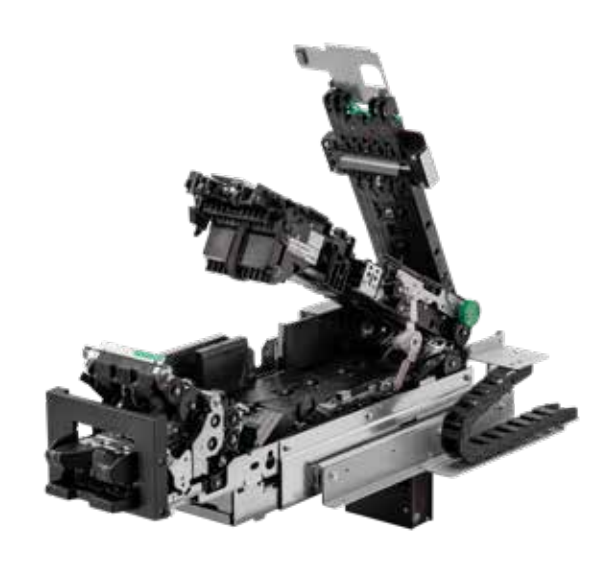
All transport paths are accessible Service-friendly design