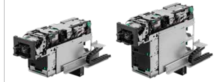
Recycler Options With 1x RC unit

*Depending on the condition of banknotes