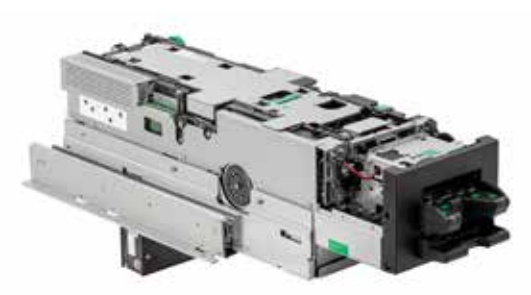
Slim Design Ideal for under-the-counter deposit safes