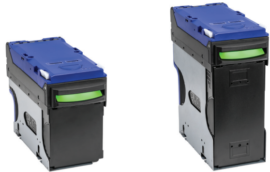
Cash Box Options With SH300