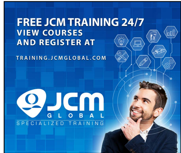
Figure 2 JCM Online Training

For information about other JCM Products, visit the JCM Global website at www.jcmglobal.com , or contact your local JCM Sales Representative at (800) 683-7248.