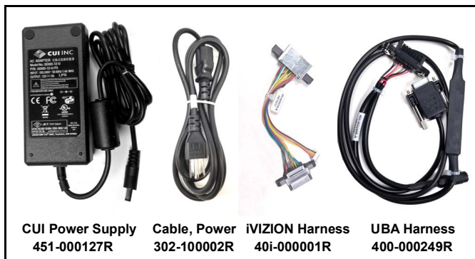
Figure 1 Power Supply Kit for iVIZION® and UBA®