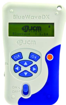
Figure 1 BlueWave™DX Tool