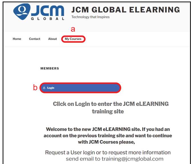
Figure 2 JCM Global eLEARNING Site Login Screen (cutaway)

For additional information on JCM Products, visit the JCM Global website at www.jcmglobal.com , or contact your local JCM Sales Representative at (800) 683-7248.